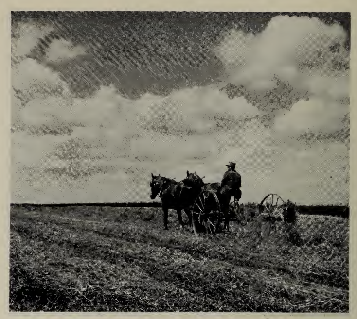
Raking—during the year under review, 2,000 tons of hay were produced.